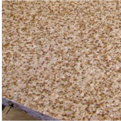
Stone top with factory seam