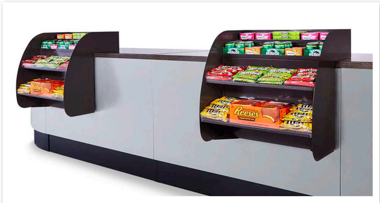
Royston's easy-to-install Counter Front Merchandiser