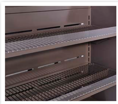
Stock It Up: Two wire shelves with 1.5" fencing