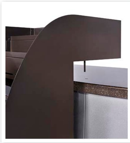
Put It Anywhere: Easy install onto any counter