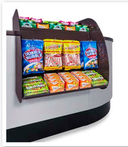
Works With You: Offers a wide range of merchandising options