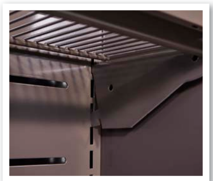
Any Arrangement: Shelves can be positioned flat or at an angle