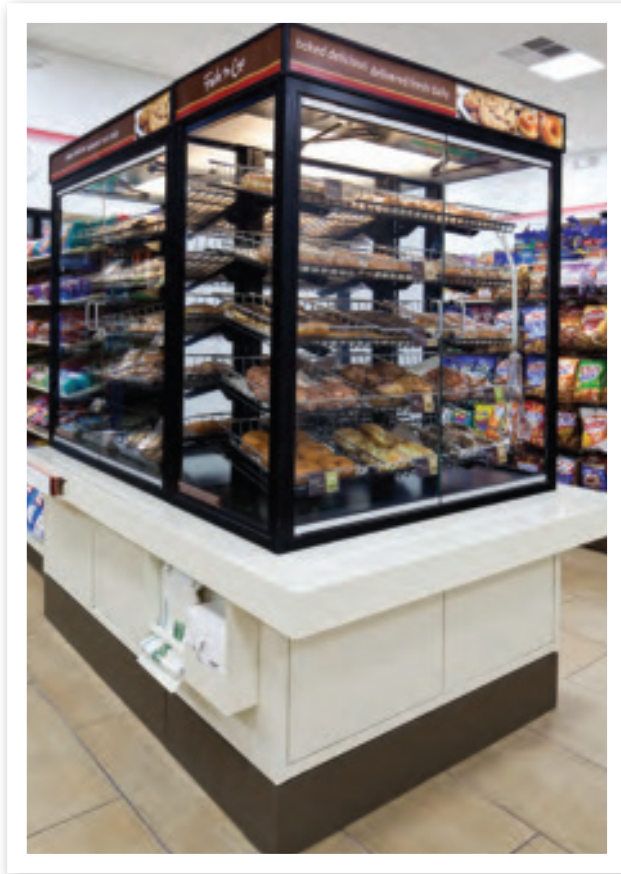
ESS Pastry Case